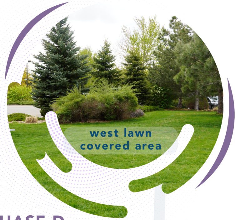
west lawn covered area